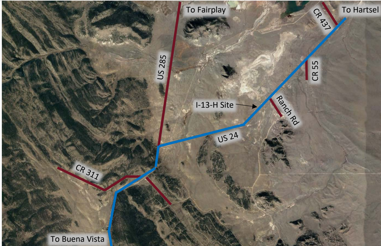
Figure 1: Vicinity Map